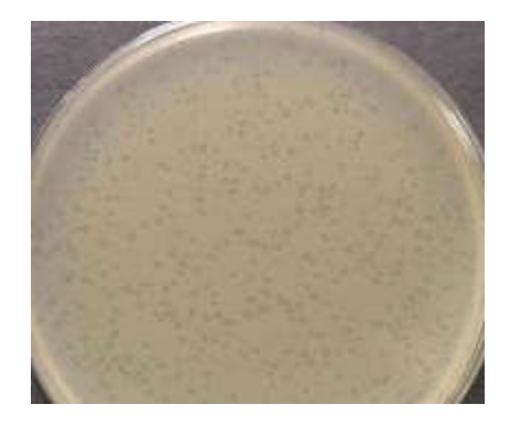
Picture 3.2. Plaques of Staph aureus : PFU/ml was calculated by double layer agar method was 10^9 - 10^{12}

circular on double agar layer plates. The size of the plaques varied from 1-5mm the plaque count of isolated phages ranged between 10^9 - 10^{12} .