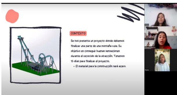
Figure 3. Challenge exposition

They were allowed a period of two weeks, in which, in class, they were confronted with normal exercises of the subject, but which gave clues to the technical development of the solution. In addition, students were encouraged to use their creativity, proposing that they link knowledge from other subjects to the solution of the learning challenge. The objective of this methodology is not only to promote comprehension of fundamental engineering principles, but also to strengthen the notion that engineering is a flexible and evolving process that relies on iterative and creative approaches. This will enable students to recognize that, in their future careers, they will frequently encounter problems that lack pre-established solutions, motivating aspiring engineers to cultivate their capacity to effectively tackle unfamiliar challenges by leveraging all available resources. Finally, the students will develop the presentation in person, in which, in 5 minutes, they will show an executive presentation, which has the purpose of showing how a project is presented to the industry, not limiting it to a technical presentation, but to develop communication and expression skills, capturing the attention of the public to which it is exposed (Figure 3).