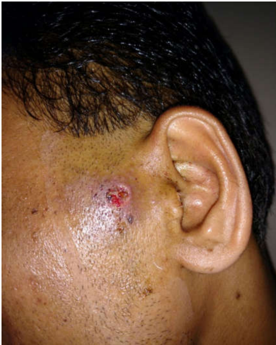
Figure 1. Showing entry wound of Bullet in left preauricular area

complete exposure of the condylar head which was found to be fractured and the fracture segments were carefully and completely removed. Upper part of the condylar process along with the condylar head was removed for better access. Hopkins 0 degree endoscope was used to further trace the entry wound down up to the infratemporal fossa. The bullet was found embedded in the infratemporal fossa just next to visible pulsations of the carotid artery. The bullet was disimpacted from the surrounding tissues very gently using the ear ball point and delivered very carefully using the endoscope. Condylar plating and the left eye tarsorrhaphy was also done in the same sitting. Post operative period was uneventful. Post operative computerised tomography showed complete removal of the bullet.