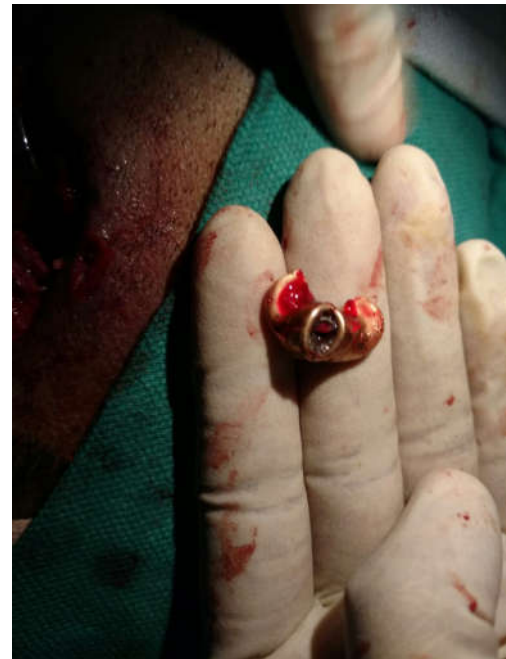
Figure 4. Showing the Bullet Removed From Infratemporal Fossa