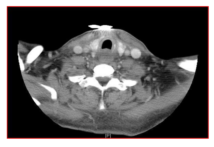
Fig 6- CT after 2 months of radical radiotherapy revealing complete remission of the lesion radiologically