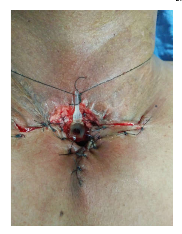
Fig. 4. After revision stomaplasty