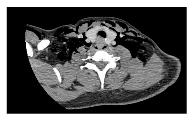
Figure 1. 30 X 20 mm subglottic lesion involving the posterior wall of the trachea extending from the lower border of cricoid cartilage to C7 level inferiorly with cricoid cartilage infiltration