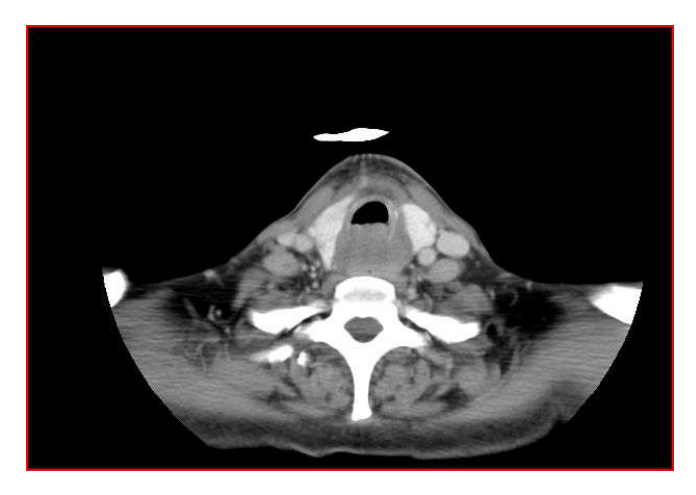
Fig. 5. A tracheal lesion infiltrating esophagus that measured about 5cm craniocaudally from C6 vertebral level to C7 vertebral level