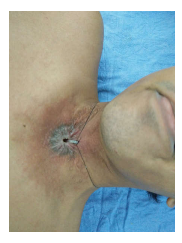
Fig. 3. Stomal stenosis with keloid formation