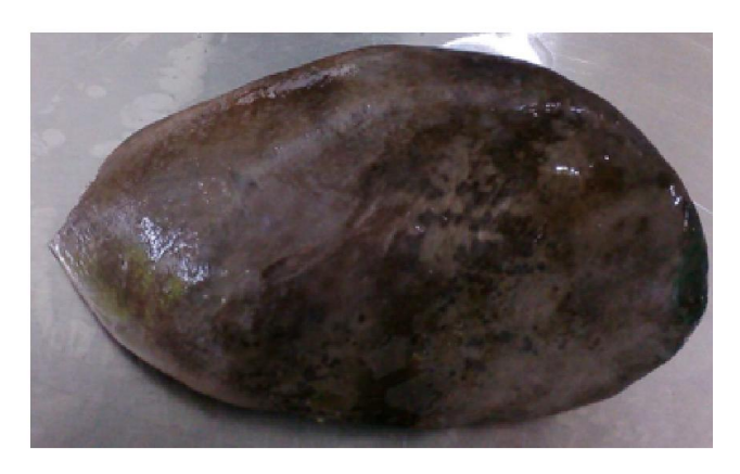
Fig. 3. showing absence of notches on both superior and inferior border seen from costal surface